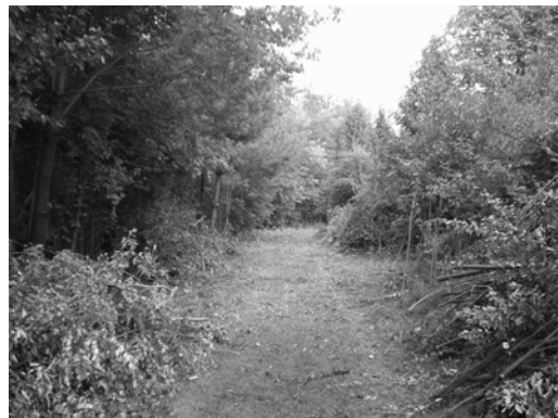
Before and after photos of exotics removal