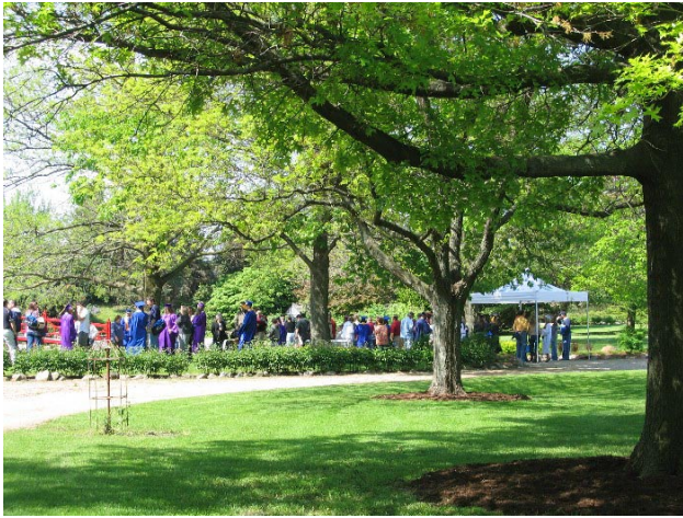
Best of the Class