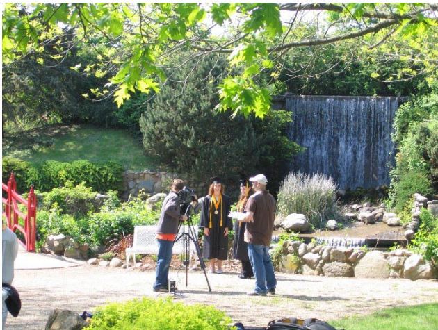
Best of the Class