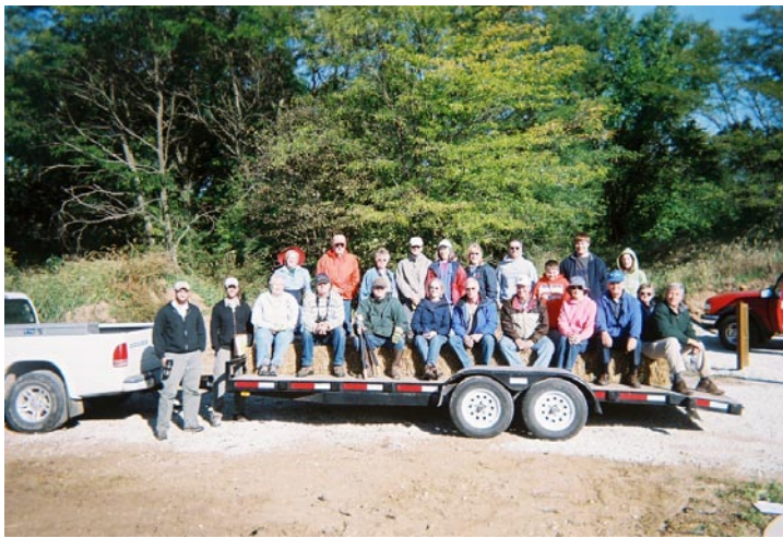
Left: Trail Stewards at the final workshop