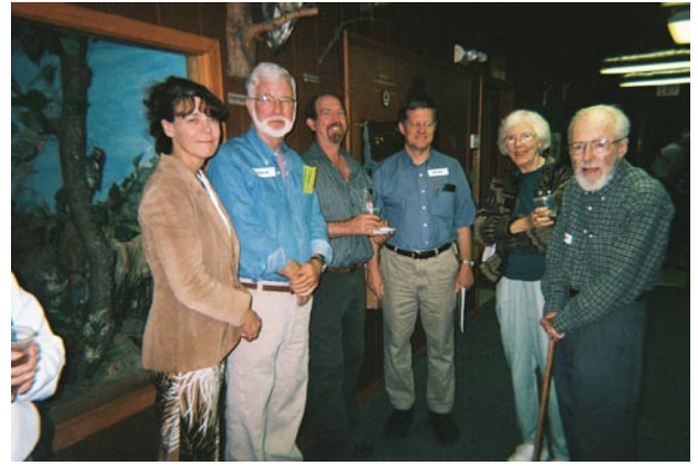
Above: Guests at the Volunteer Recognition Evening