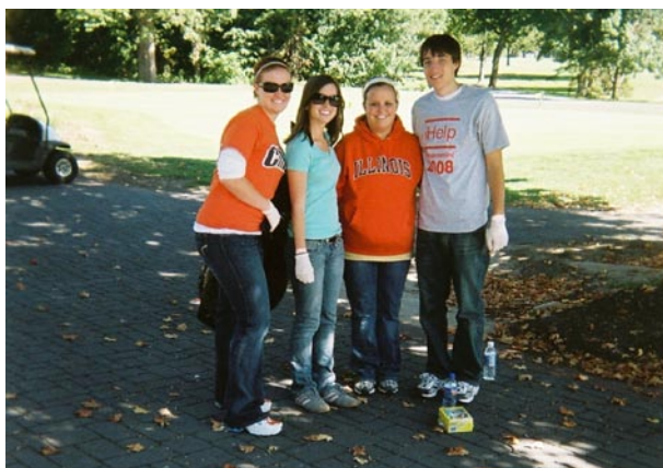
Below: Students with the I-HELP program