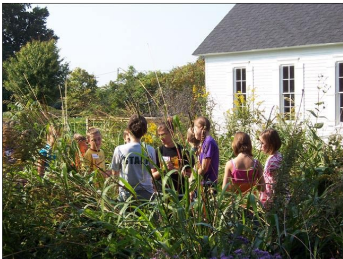
Above are three pictures from the Prairie Adventures school program. Below, at the Prairie Stories public program, two volunteers watch a young girl learning to spin.