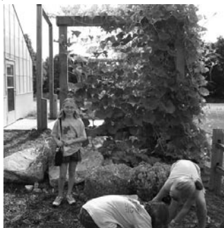
A camper in front of the gourd trellis