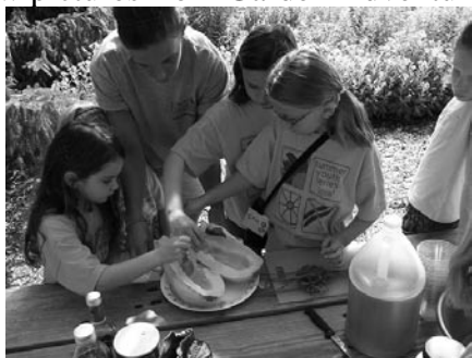
Campers prepare treats for the Open House.