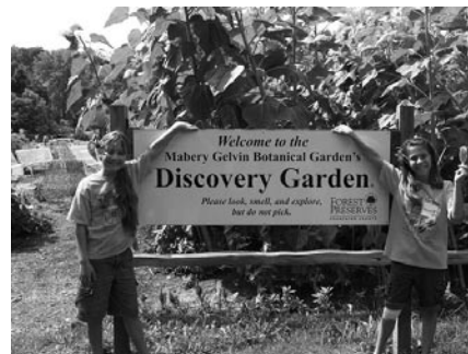
Campers pose in front of the Discovery Garden sign.