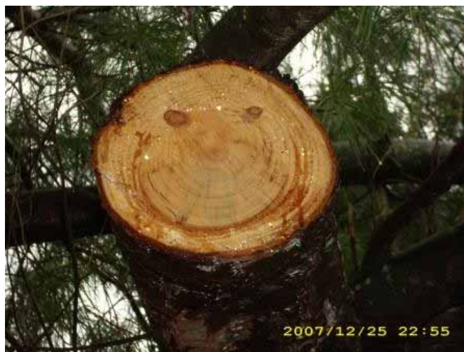
Even in bad weather, volunteering causes smiles!