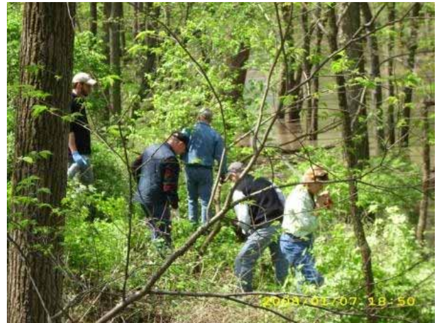
Trail Steward Workshop