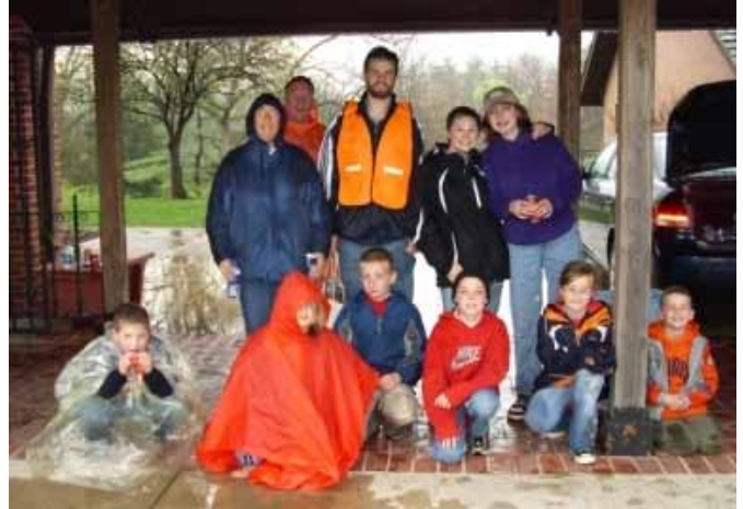
Volunteer Clean-Up Day