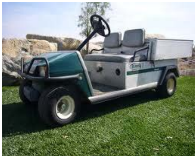
Club Car Carryall 2