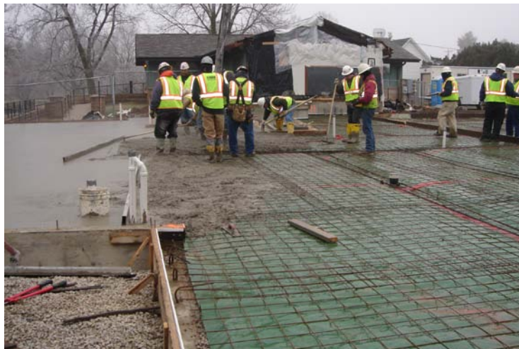
Concrete pour and flooring installation finally underway