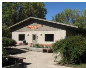
Lake of the Woods Pavilion

* Rent an enclosed pavilion (if available) as a rain backup and/or reception location at a discounted rate.