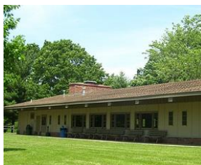
Elks Lake Pavilion