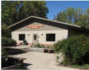
Lake of the Woods Pavilion

* Rent an enclosed pavilion (if available) as a rain backup and/or reception location at a discounted rate.