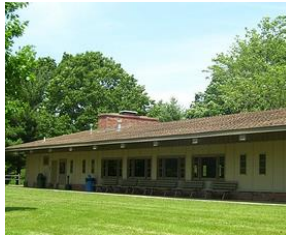
Elks Lake Pavilion