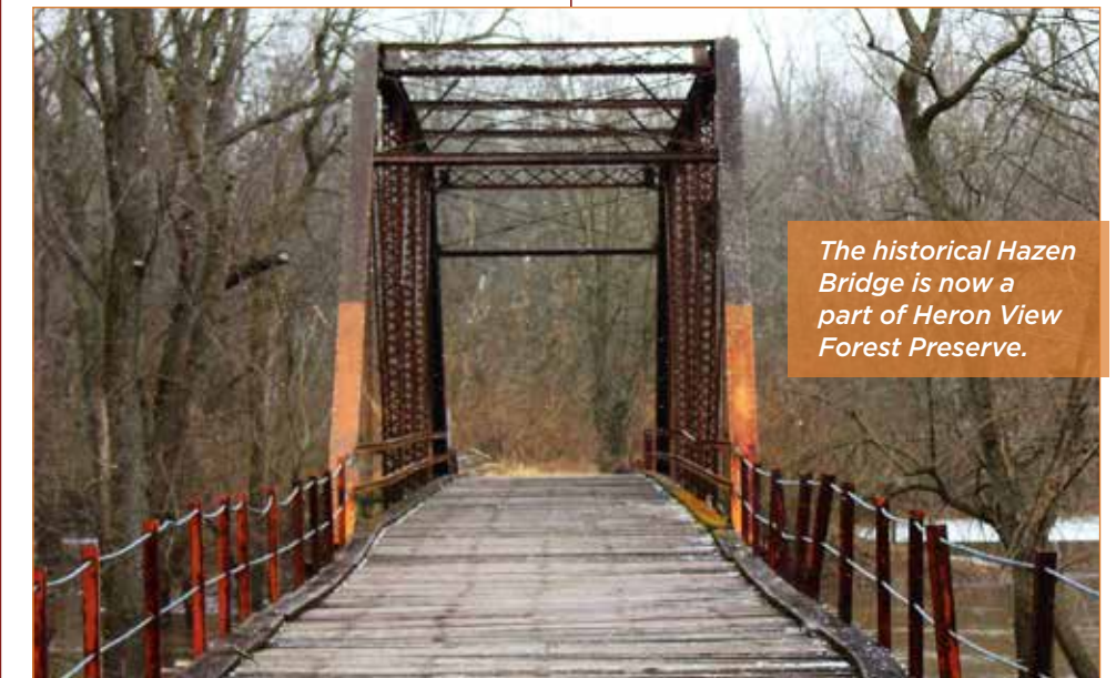
The historical Hazen Bridge is now a part of Heron View Forest Preserve.

The Hazen Bridge is of historical significance due to the Pratt truss design. It is one of only two truss bridges remaining in Champaign County. The bridge was constructed in 1893, and is listed in the National Register of Historic Places. The bridge will remain observable for historical