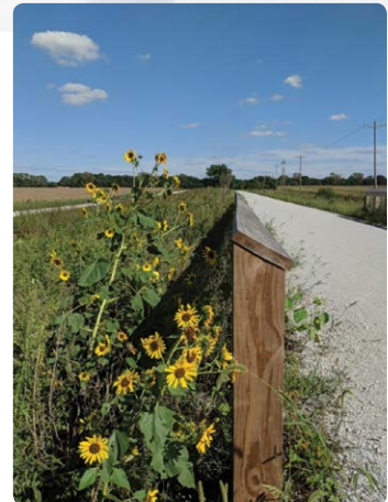
Native sunflowers abound along the Kickapoo Rail Trail in the fall.

Weed management along the Kickapoo Rail Trail was another focus of work throughout the year. We had largely stayed out of the way of construction in the previous two years, but in the first year of open trail between Urbana and St. Joseph, a considerable amount of invasive plant management was necessary. Target plants included noxious Canada thistle, teasel, and sweet clover. Through targeted herbicide application, prescribed burning, and selective seeding, we hope to bring the remnant native vegetation back to a semblance of what it was in its prime. We hope you'll find our efforts worthwhile when you visit us in 2019!