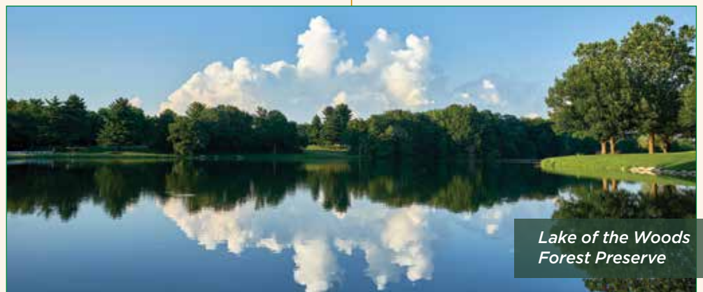
Lake of the Woods Forest Preserve

No cloud date. Call (217) 351-2567 for weather updates. All ages. FREE. Register by July 29 at ccfpd.org to receive updates.