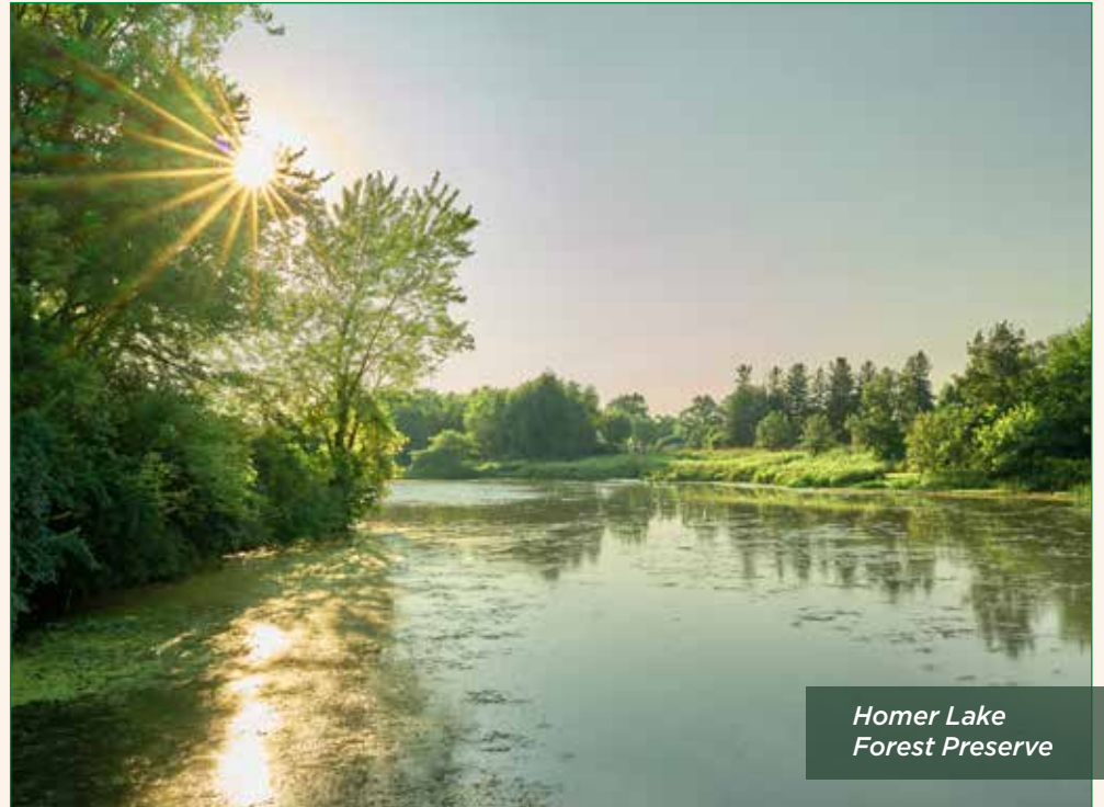
Homer Lake Forest Preserve

All ages. FREE. Space is limited; registration required by June 23 at ccfpd.org .