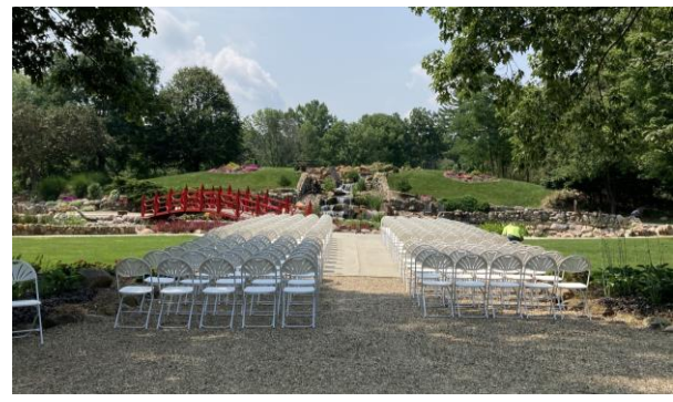
ELECTRICTY : There is one standard electrical outlet at the site; GFI-protected for your safety.

A standard setup has been established for each location. Chairs will be set up/taken down by staff.